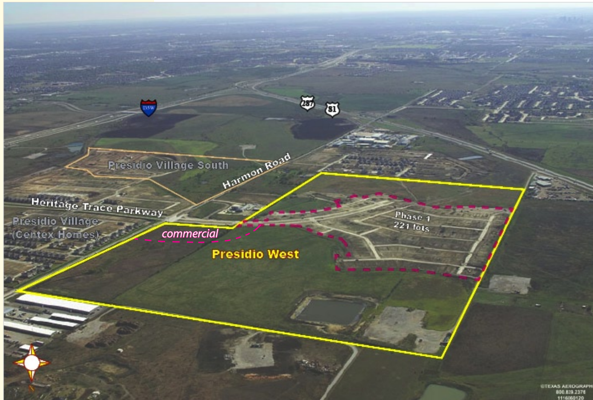
Heritage Trace Parkway & Harmon Road Fort Worth, TX